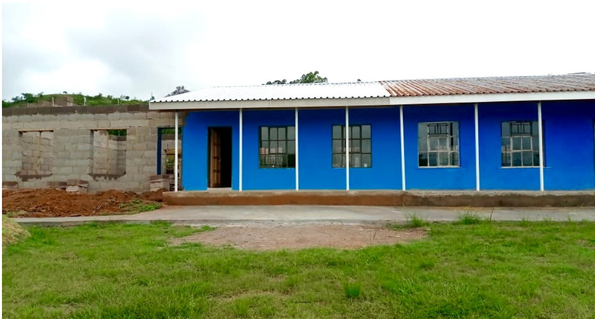
First classroom completed (July 2022) - middle of photo with light coloured roof.

Construction of the 2nd classroom is going well, although it had been temporarily halted as the builder had asked to be excused for a short while. Work was set to resume at the beginning of November to be completed by the end of the month. You can see the construction of the 2nd classroom to the left of the first completed classroom above as it was at the beginning of November.