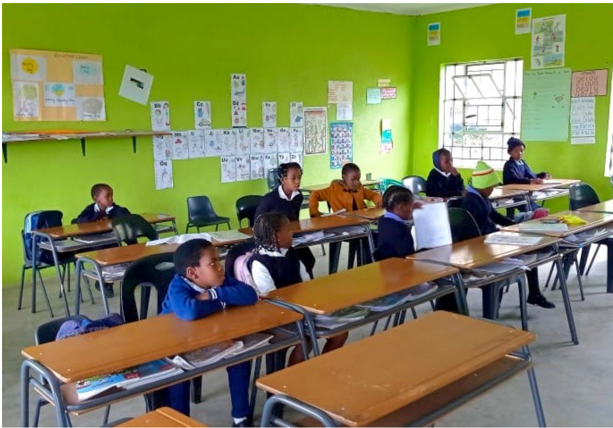
Children ready to study in the first classroom.