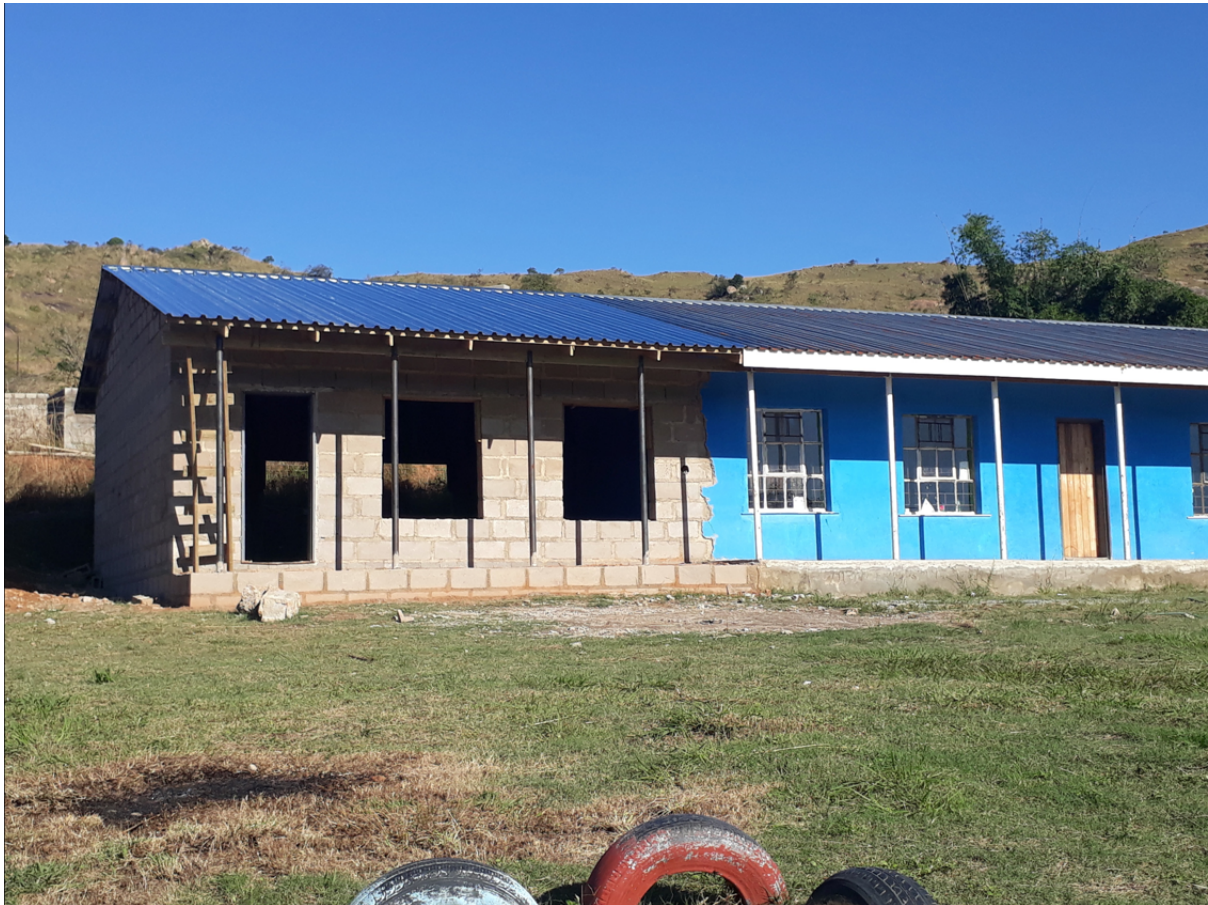
Lobamba SDA Primary School Building progress

Lobamba SDA Primary School Building Project Fundraising - We have reached our fundraising goal of $30,000 for phase 1 and are waiting for the funds to be released to us. We have started fundraising for phase 2, and at present we have raised $1,500.