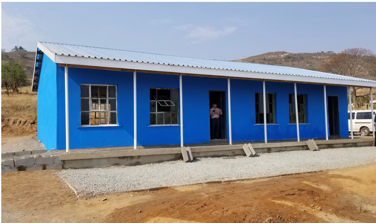
Newly built classroom, Mbabane, Eswatini